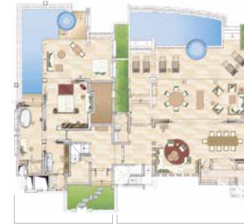
Beachfront Luxury Pool Suite with Jet Pool & Hammam