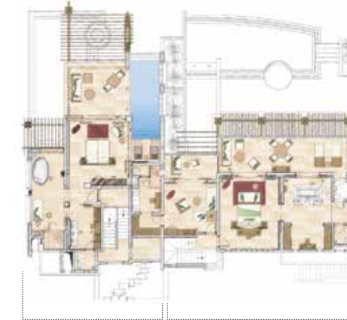
Oceanfront Luxury Pool Suite with Hammam